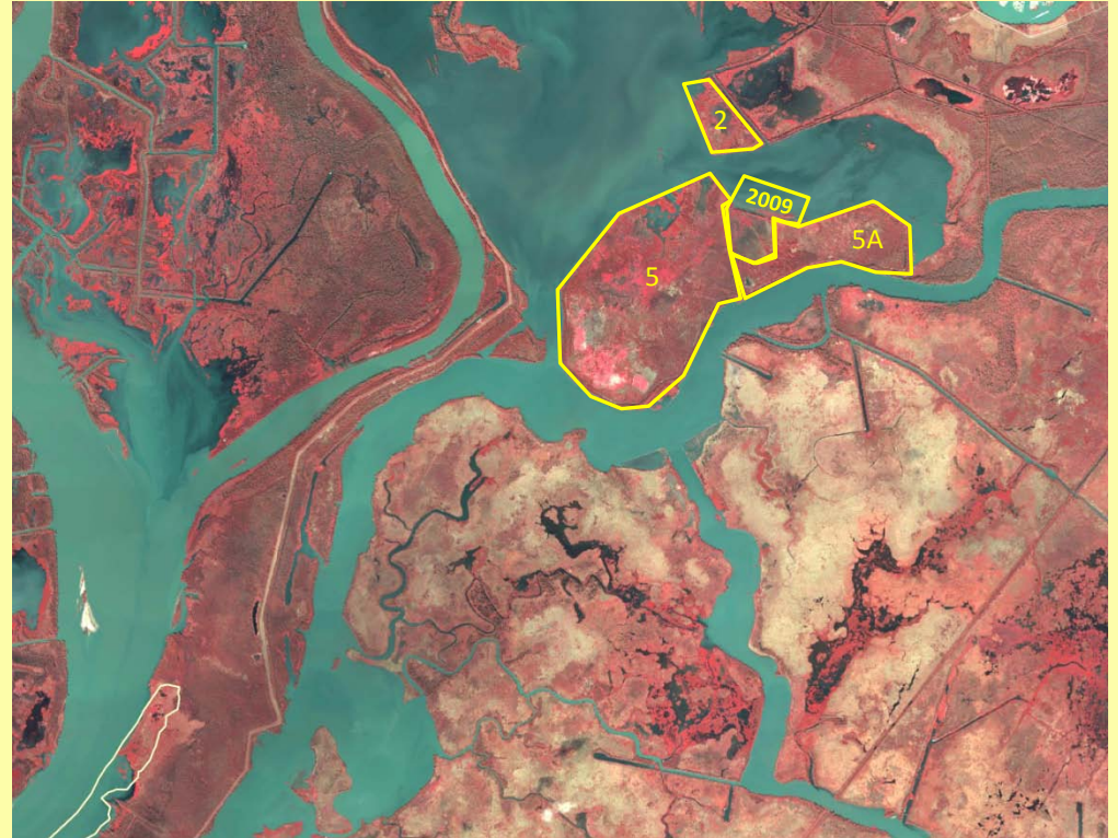
ATCHAFALAYA RIVER AVOCA ISLAND